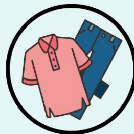
Clothes + toiletries