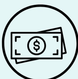
Cash (Small bills)